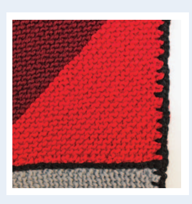
Blanket stitch Double crochet edging