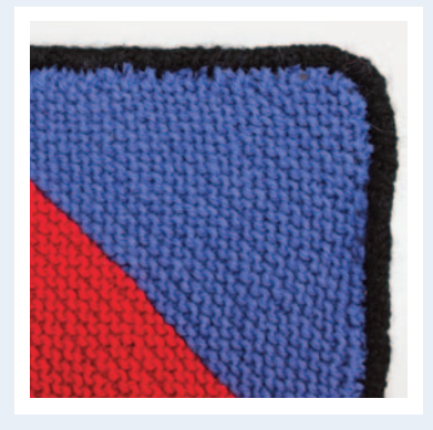
Blanket cord edging

All ends of yarn should be securely woven in and snipped off. Check that pins or needles have not been left in your work.