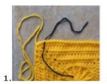
*How to 'butterfly the tail' is as easy as 1, 2, 3. Use contrasting yarn and follow the steps below:

The crochet squares have been designed at 8 \times 8 " (20cm) to make sure that they can be quickly made. The tail at one end of the square should be 20" (50cm) long and butterflied* to the square.