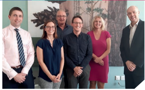
The Inspire Board