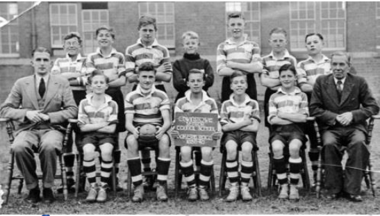
Council School Football Team, Fourth Avenue