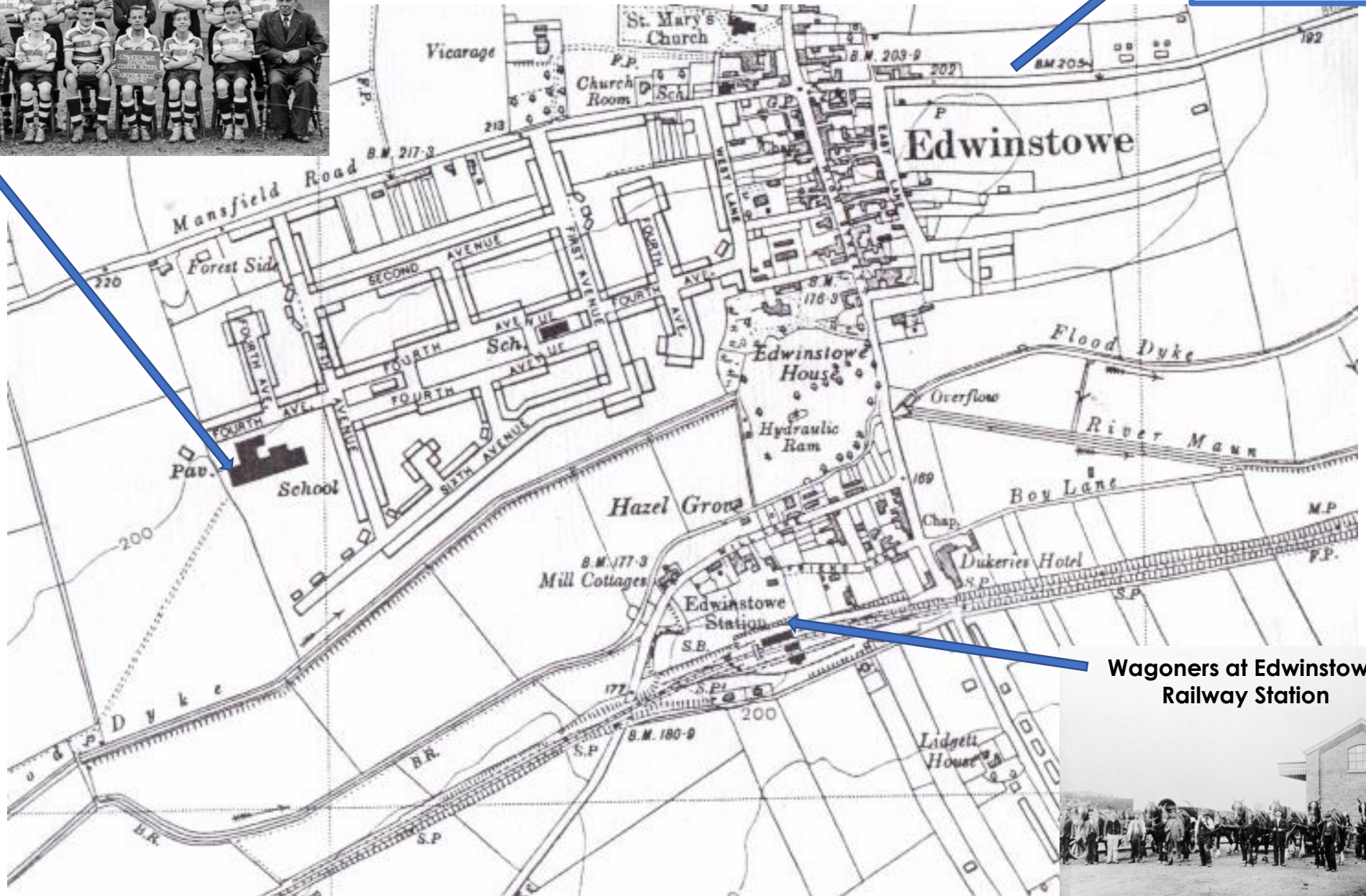
Wagoners at Edwinstowe Railway Station