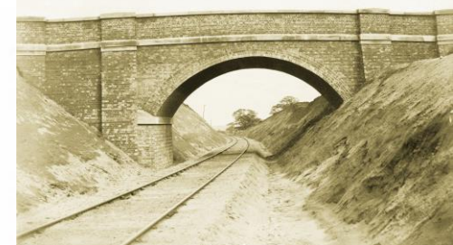
Kirklington Road Bridge over Mansfield to Southwell Railway