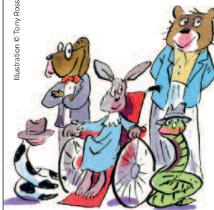
Illustration © Tony Ross