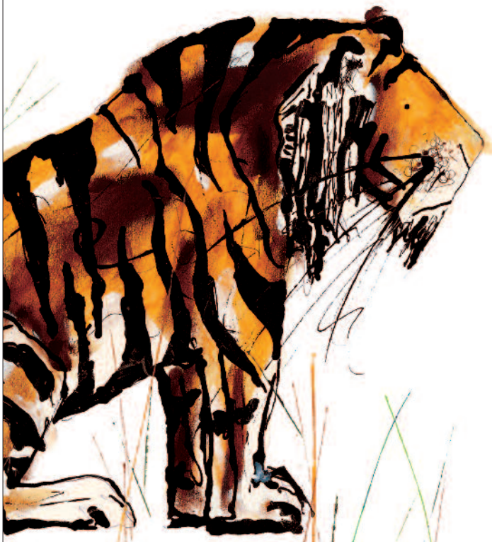
Illustration from Augustus and His Smile , © Catherine Rayner, 2006. Published by Little Tiger Press

Supported using public funding by ARTS COUNCIL ENGLAND