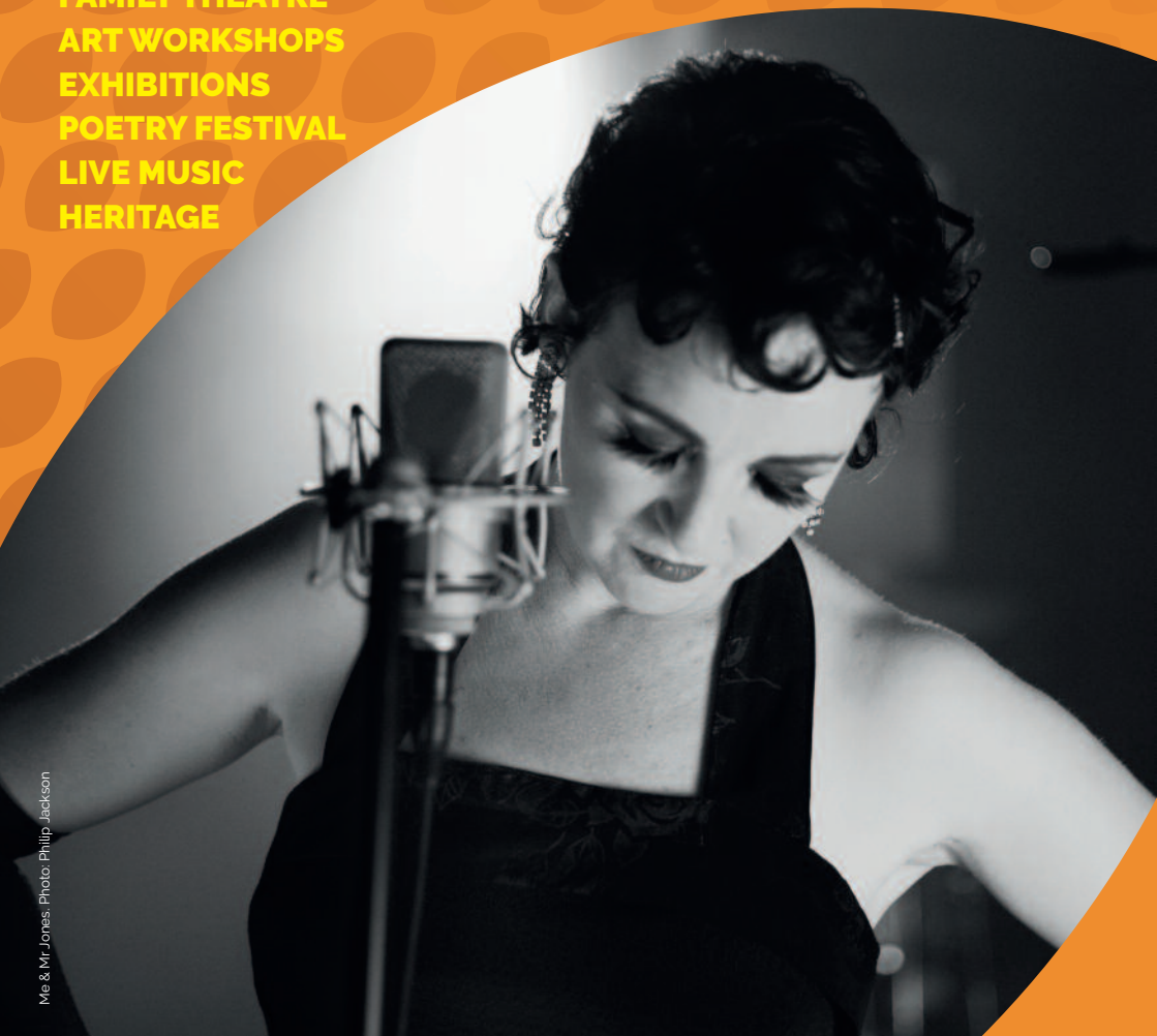
Me & Mr Jones

FAMILY THEATRE ART WORKSHOPS EXHIBITIONS POETRY FESTIVAL LIVE MUSIC HERITAGE