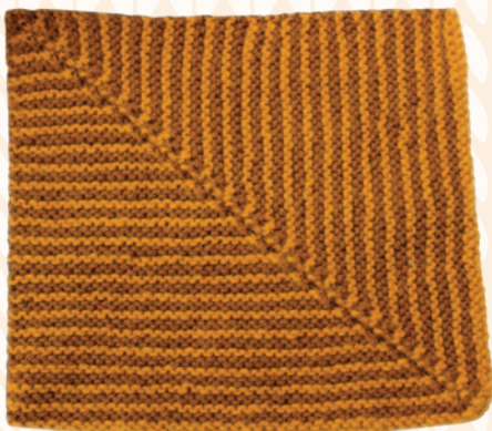
Knitted square in two colours

The Story Snuggler is made from six 23cm (9 inch) squares