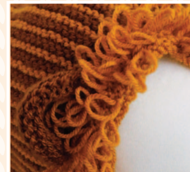
Detail of loops

Story Snugglers are designed as simple hand knitted or crocheted ponchos, in one size with loose hoods and without fastenings, for children aged 2 to 4 years (not suitable for babies):