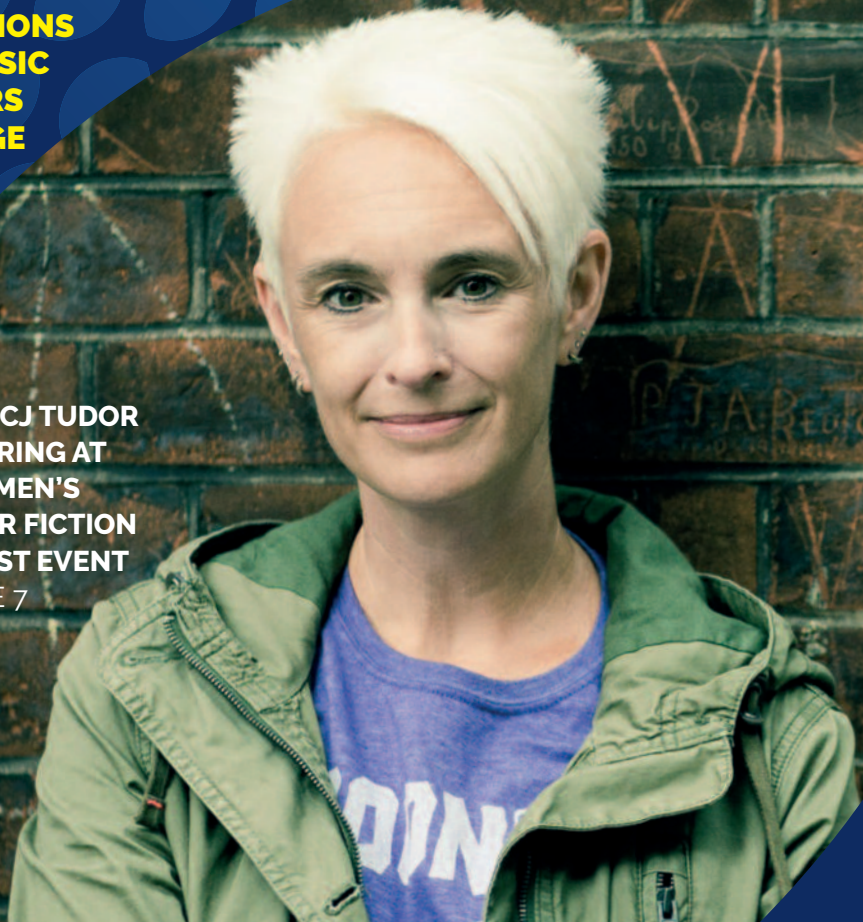
PHOTO: CJ TUDOR

AUTHOR CJ TUDOR IS APPEARING AT OUR WOMEN'S PRIZE FOR FICTION SHORTLIST EVENT SEE PAGE 7